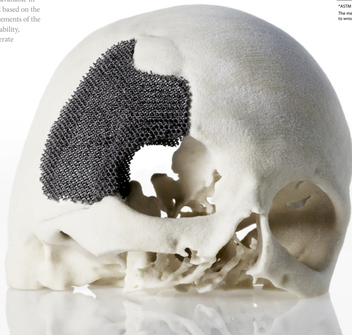
Lattice skull implant manufactured with Arcam EBM.

Titanium Grade 2 may be welded by a wide variety of conventional fusion and solid-state processes, although its chemical reactivity typically requires special measures and procedures.